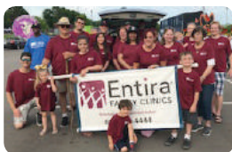
Rose Day Parade June 22