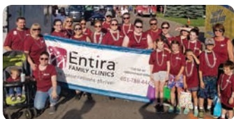
Kaposia Day Parade June 21