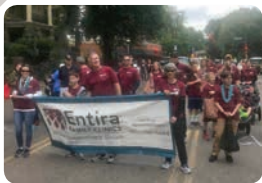
Grande Old Day Parade June 2

Summer is a busy month, but our staff and providers got out to enjoy some fun at local parades and events!