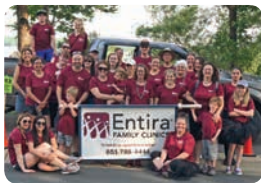
Manitou Day Parade June 15